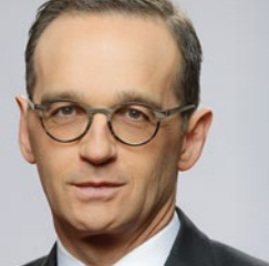
Heiko Maas Federal Minister of Foreign Affairs

I would like to thank the WDR for staging this event for the 21st time, offering us the chance to discuss our place within Europe and opening up new vistas. I feel especially honoured that the Foreign Office has again been invited to host the event in 2018 – I wish you all an exciting and fruitful day full of animated discussions on Europe.