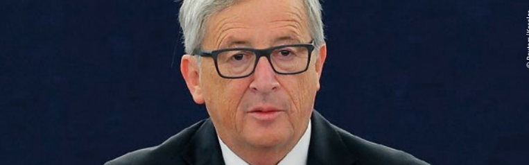
Jean-Claude Juncker President of the European Commission

The WDR Europaforum provides a wonderful opportunity for an inspired, open, critical-constructive exchange. You are all very welcome to participate in this discussion. It concerns our common future!