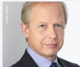
Tom Buhrow