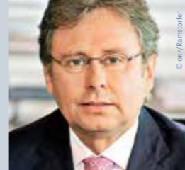
Alexander Wrabetz Österreichischer Rundfunk