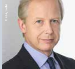
Tom Buhrow Westdeutscher Rundfunk